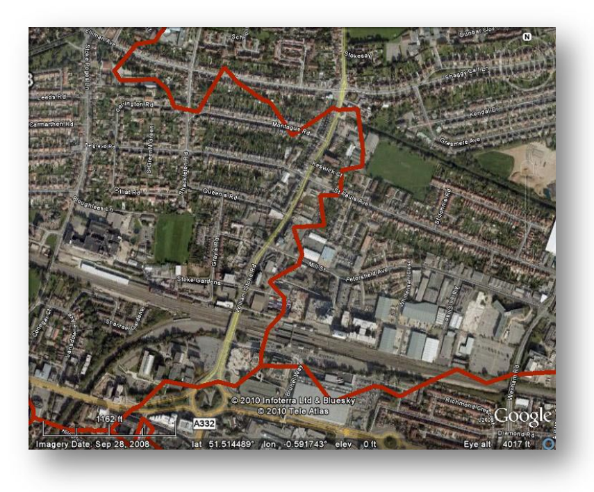
Fig 2: Postcode Sector boundary in red overlaid on aerial photography in Google Earth. Note how the boundary follows the road but does not trace it exactly. In this case the boundary is offset from the road centreline by approximately 100 metres.

Fig 1: Code-Point<sup>®</sup> Postcode locations coloured according to their Postcode Sector and the corresponding Postcode Sector boundaries. Note that all Code-Point<sup>®</sup> Postcode locations are contained within their corresponding Postcode Sector polygon.